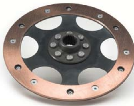
Sprzęgło BMW ze spieków metalicznych