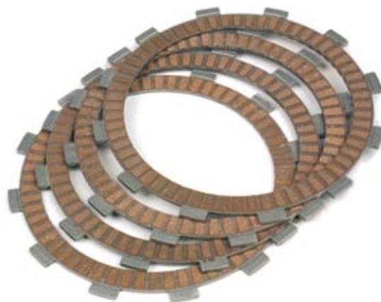
Sprzęgło mokre wielotarczowe

Użycie niektórych motocyklowych olejów syntetycznych lub oleju samochodowego może zwiększyć ryzyko poślizgu sprzęgła